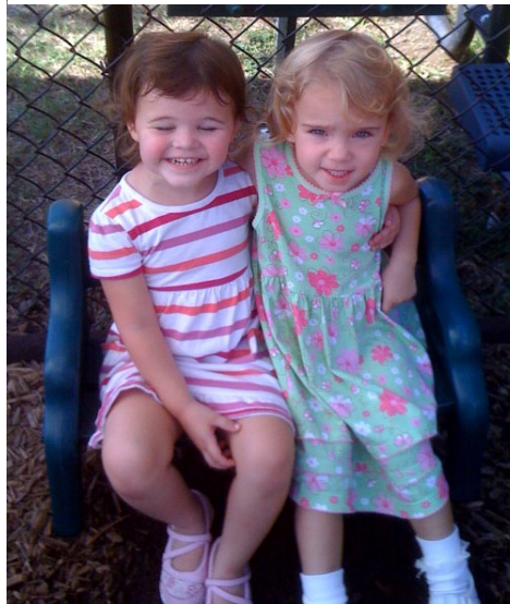
'2'S' ENJOYING A PLAY BREAK